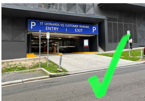
CORRECT ENTRANCE FOR ST LEONARDS SQUARE