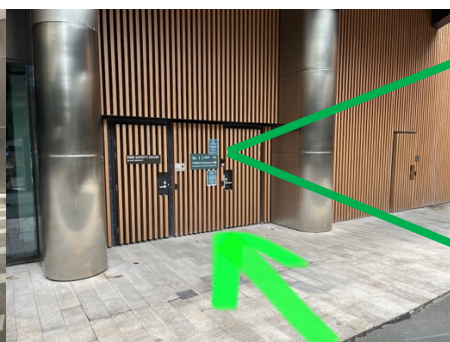
Look for "PATIENT ENTRANCE" Door