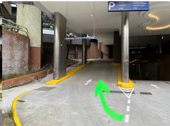
Turn up the far left ramp