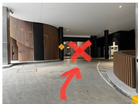
PLEASE DO NOT ATTEMPT TO ENTER COMMERCIAL PARKING AT LANDMARK