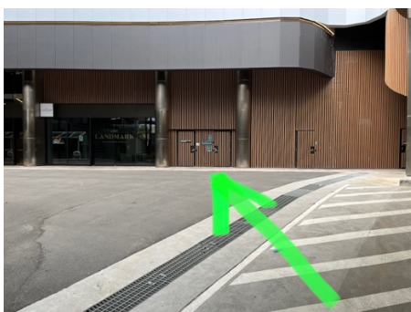
Veer LEFT at top of ramp