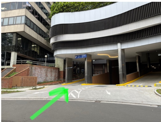
Turn off Nicholson Street